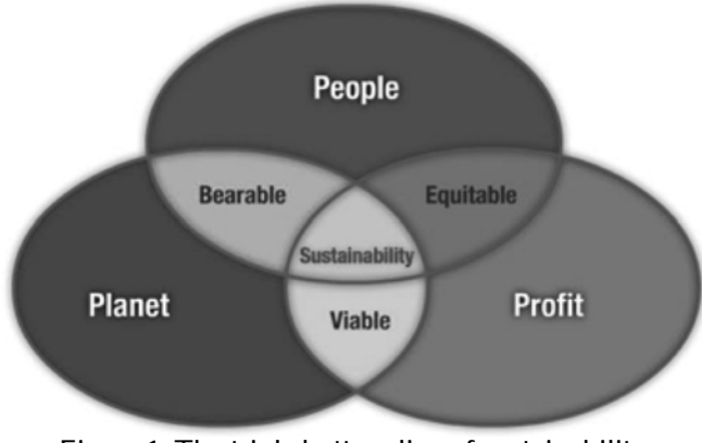
Figure 1. The triple bottom line of sustainability [Chiu and Chu, 2012]

During the 1990s, it became clear that one should slow down the consumption of the finite natural resources and minimise the pollution generated by the human activity as a means to achieve sustainability. It was also acknowledged that the current generations should ensure the future fittingness to life of Earth, as well as the welfare of the next generations. This awareness is transversal to all the human activities, including engineering design, which must therefore concern with society, environment and economy along the whole life cycle of the design objects, in a simple scheme usually abbreviated through the PPP acronym, which means people, planet and profit, as shown in Figure 1.