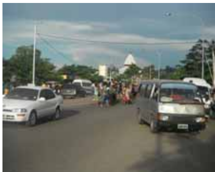
Figure 13. Uncontrolled pedestrian at central market

From figure 12, the three critical locations shown by circles are causing the congestions: 1) uncontrolled pedestrian crossing at the central market (figure 13), 2) the roundabout at the city council headquarters accommodates all two highways and three access roads, and 3) a single approaching lane to the 2-lane Metaniko Bridge (includes the new bridge) that funnels traffic into a bottleneck when approaching a 4 lane drive leading to the business area and the international airport. However, the cause of all these problems is the lack of road reserve for further expansion. Actually, there is none as of the conduct of this study. Commercial buildings and other structures occupied reserve spaces.