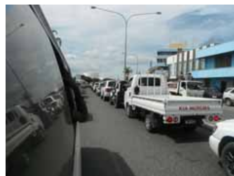
Figure 6. Traffic Jam at Mendana Highway