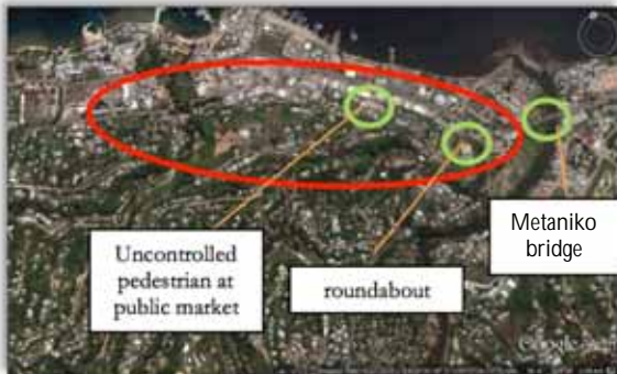
Figure 12. Mendana Highway

The roundabout has a diameter of 40 meters and has two arms, two double lane highways and three feeder networks.