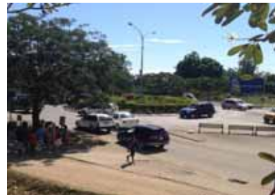
Figure 10. Honiara Roundabout