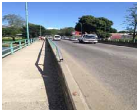
Figure 8. Metaniko Bridge 2-Lane exiting to Single Lane

Metaniko Bridge is a steel girder bridge with concrete decking in asphalt layered, sub-structure is concrete abutment and concrete piers. Length is approximately 80 m, width of 10 meters, and double lane. It lies along the Mendana Highway, adding the effect of congestion due to un-match exit lane to and from the bridge.