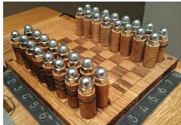
Fig. 2. Chessboard and pieces in implementation